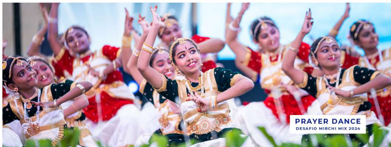
PRAYER DANCE DESAFIO MIRCHI MIX 2024